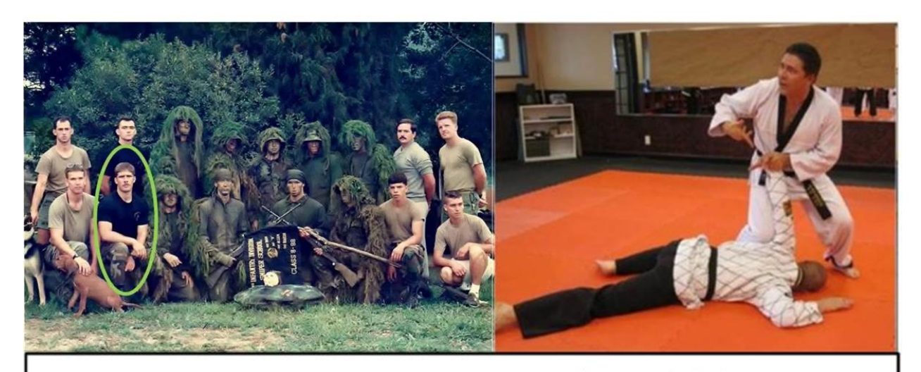
Former U.S. Army Sniper Instructor